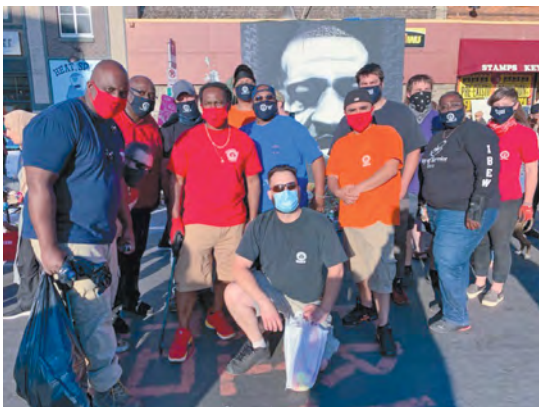
IBEW Local 292 members, including members of the RENEW and EWMC Committees, pictured here at the George Floyd Memorial in Minneapolis, which they helped restore and where they provided meals for the community.

L.U. 292 (em,govt,i,rtb,rts&spa), MINNEAPOLIS, MN — Work has slowed over the summer and is expected to slow even more as the delayed effect of the COVID-19 economy contribute to slowed construction project starts. Typically, in the past the slowing of private construction projects in Minnesota has been supplemented by public capital investment projects to help bridge the gap through recessions. Unfortunately, as of this writing in August our state Legislature has failed miserably to agree upon a bonding bill to provide the funds for those publicly funded projects.