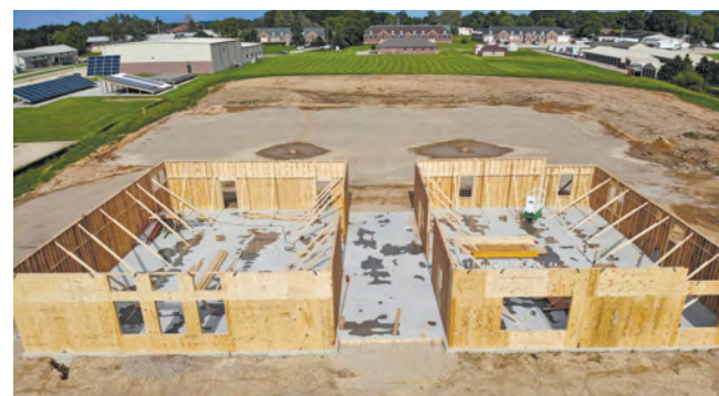
The new Local 34 union hall in Bartonville, Ill., is under construction.