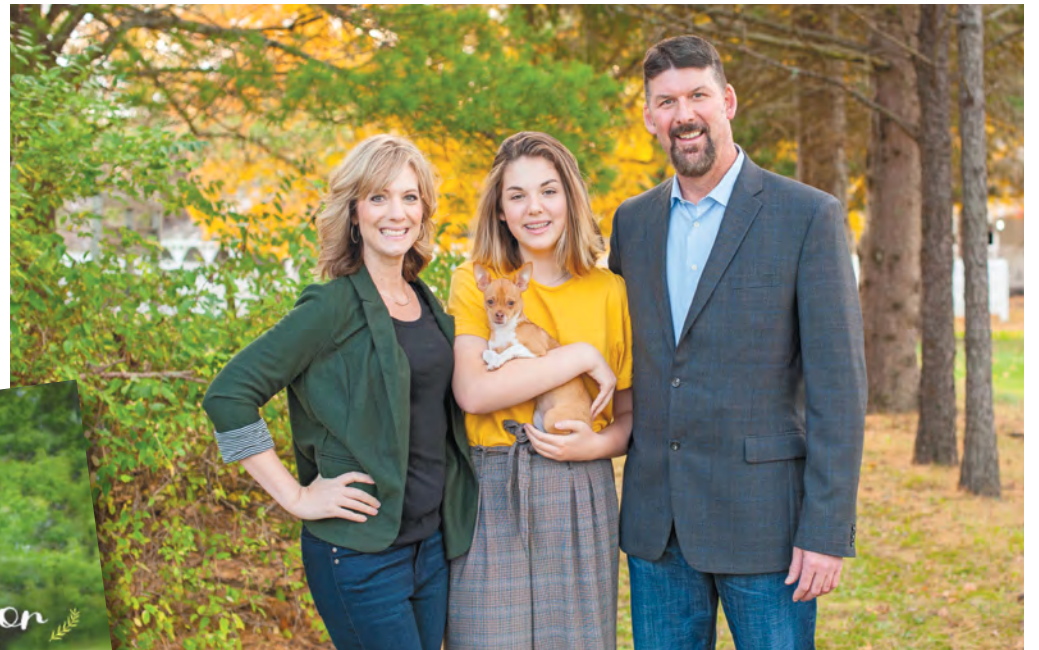
"Praying for Emily," the Whitehead family's story, will be released on Oct. 6.