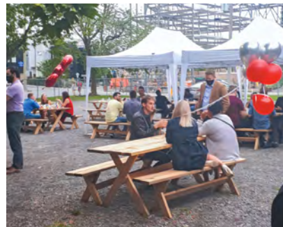
Ottawa, Ontario, Local 2228 has shared its parking lot with a neighboring restaurant to help it weather the coronavirus.

Without this outside option, Bar Laurel would have been left with indoor seating that could only be used at about a third of its normal capacity, since it has to allow for the required six feet (or two meters) between customers. That means the chance to only make a fraction of its pre-COVID-19 revenue.