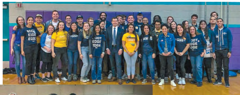
When the staff for Pete Buttigieg's campaign heard about the contract Warren's workers had negotiated, they knocked on the door of Cedar Rapids, Iowa Local 405 to form their own union with the IBEW.