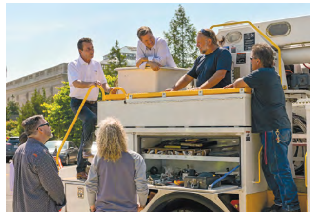
Rep. Donald Norcross is the only active IBEW member in Congress, representing New Jersey’s union-dense 1st District.

But a strong union presence changes that.