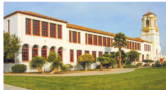
Castroville, Calif., Local 234 members volunteered their time to restore the bell system at Salinas High School in time for its 100th anniversary this year.