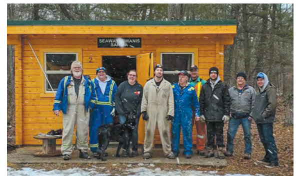
A group of Local 530 members volunteered their time pre-COVID-19 to wire new cabins for the Attawandaron Scout Reserve on the banks of Lake Huron near London, Ontario.