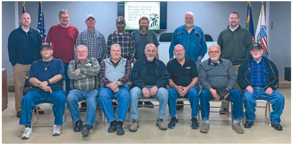
Local 873 held its third Retiree Breakfast in March.